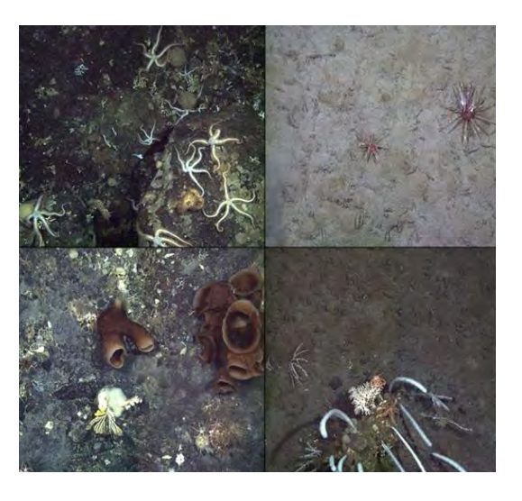
Figure 3. Seafloor habitats photographed during JR15005. Example images include Vulnerable Marine Ecosystem (VME) indicator groups.