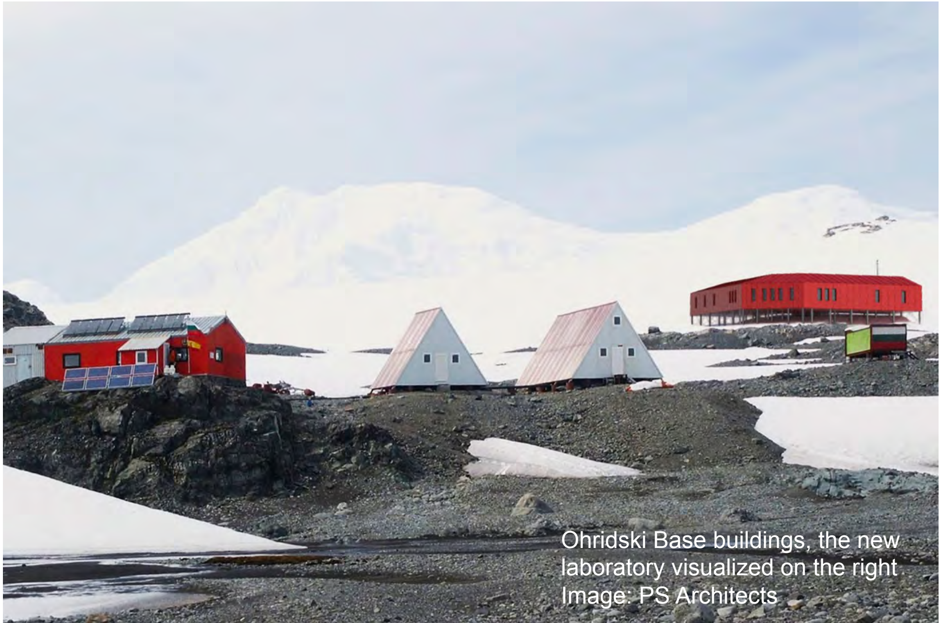
Ohridski Base buildings, the new laboratory visualized on the right Image: PS Architects