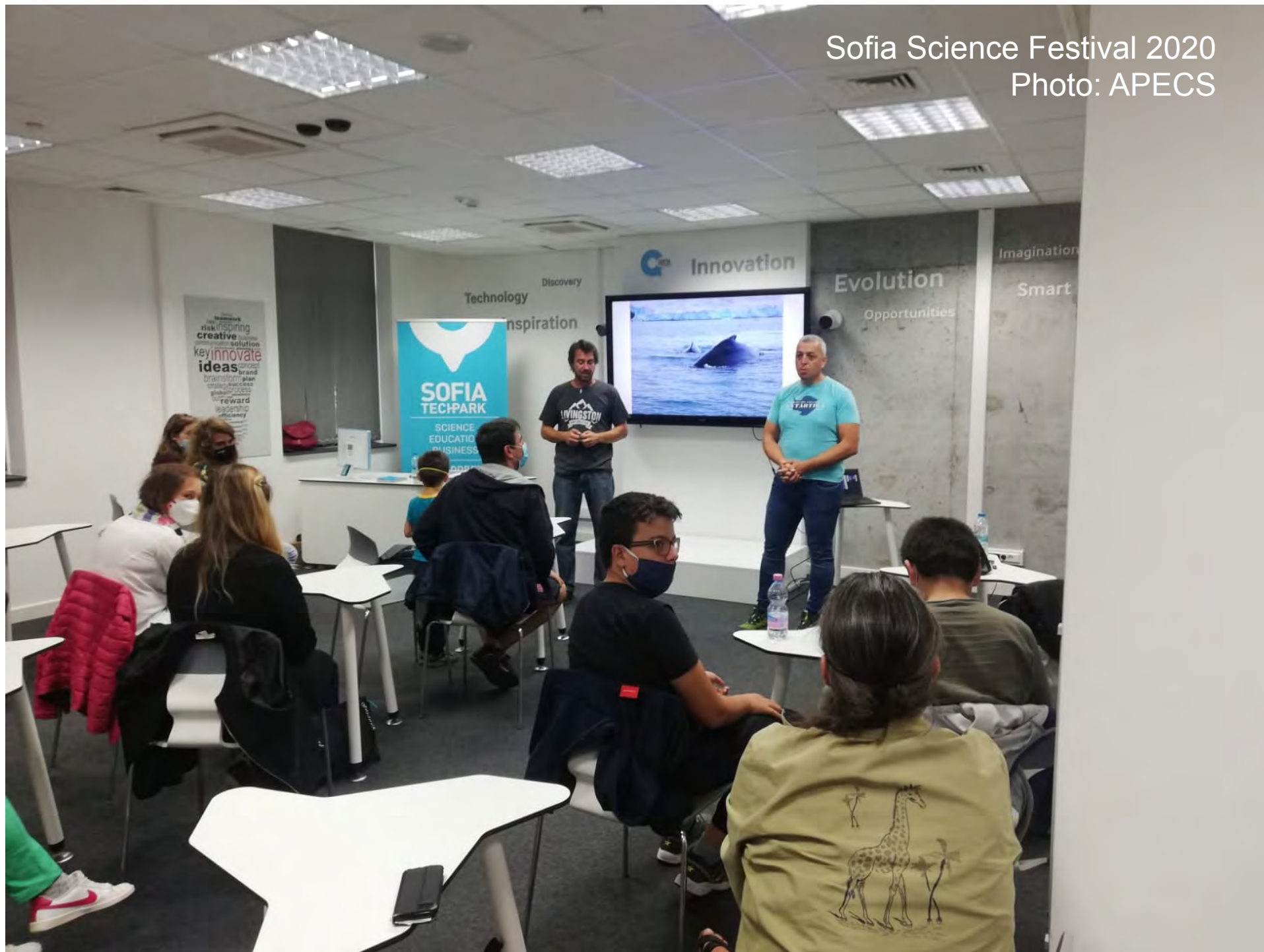
Sofia Science Festival 2020