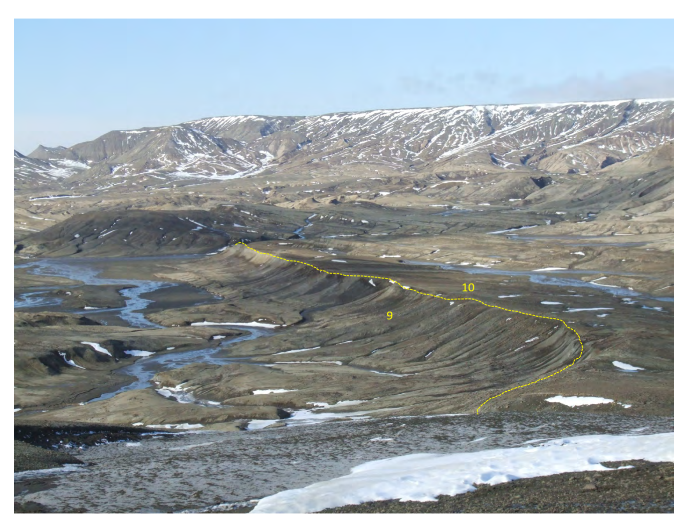
Figure 2.3: The K-Pg boundary at the northern end of its area of outcrop on Seymour (Marambio) Island, north-eastern Antarctic Peninsula. The boundary occurs at the top of a distinct scarp that can be traced in a southerly direction across the island. Informal mapping Unit 9 marks the top of the Cretaceous (K) and Unit 10 the base of the Paleogene (Pg). This is one of the best exposed K-Pg boundaries anywhere in the world.