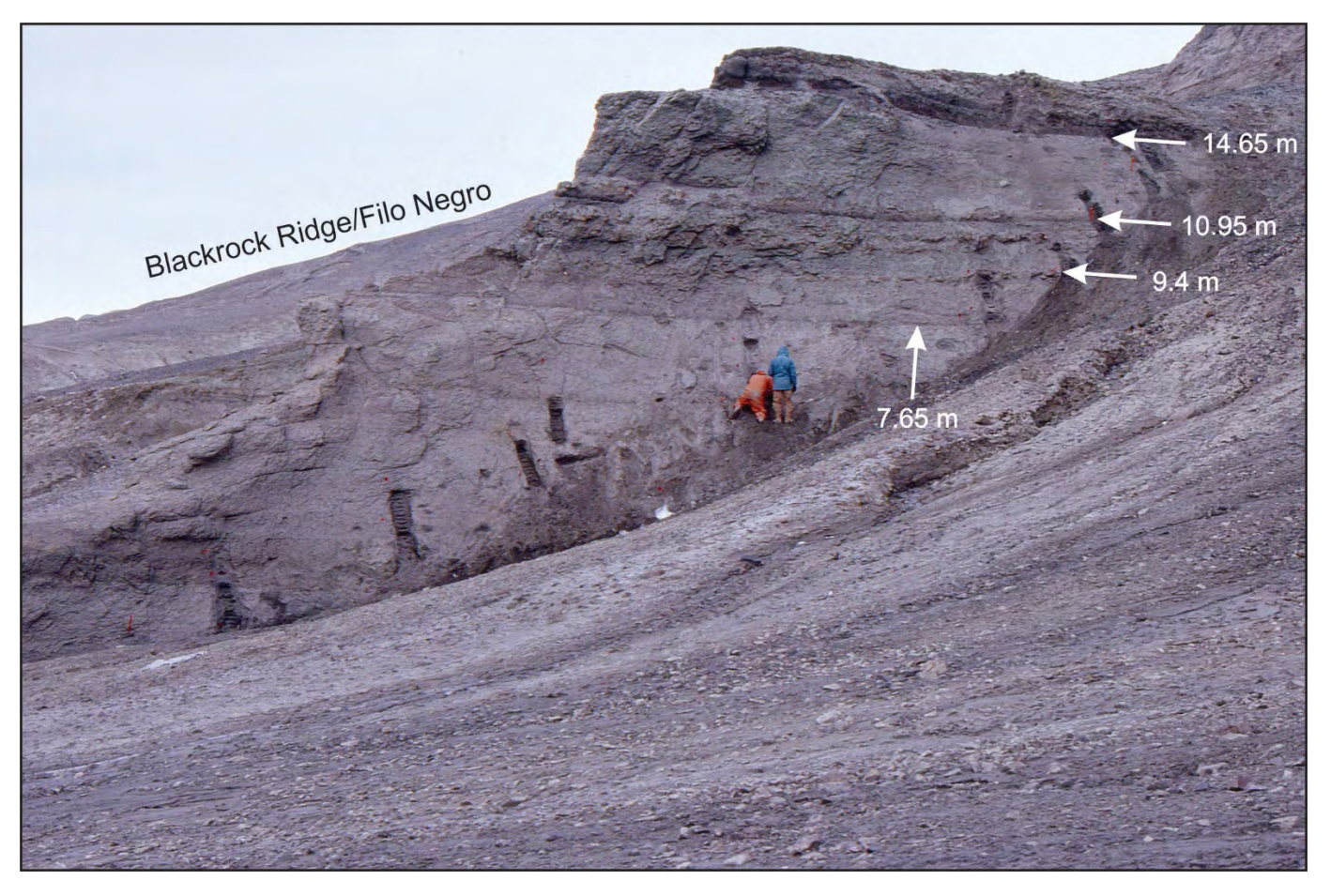
Figure 2.2: Photograph showing the site of the iridium anomaly identification, with white arrows referring to the stratigraphic section of Elliot et al. (1994). Skyline formed by Blackrock Ridge (Filo Negro) dyke.