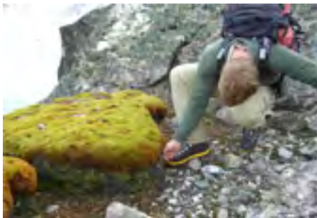
A researcher studying the moss bank at Lazarev Bay

The Peninsula sustains moss banks, some of which are more than 5000 years old.