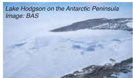
Lake Hodgson on the Antarctic Peninsula

For more details, see the BAS website: http://www.antarctica.ac.uk/press/press_releases/press_release.php?id=2308