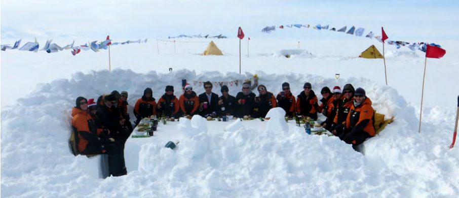
Flags flying as banner at Windless Bight near McMurdo, where the University of Canterbury Gateway Antarctica course had their Christmas dinner.

Simply print flag, photograph south of 60 degrees, record position if possible, and send photo and location back to director@ourspace.org.uk . Certificates will be sent to the schools around the world who participate. Thank you!