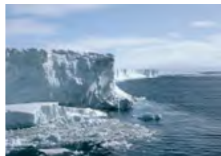
The calving front of the Filchner Ice Shelf, Antarctica

For more information, see the news item on the University of Bristol website ( http://www.bristol.ac.uk/news/2013/9743.html ) or read the full paper in Nature - Letters ( http://www.nature.com/nature/journal/vaop/ncurrent/full/nature12567.html ).