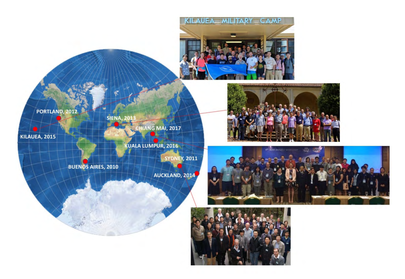
Figure 1: The SCAR SRP "Astronomy and Astrophysics from Antarctica (AAA)" has met as an international group every year since the formation of the SRP in 2010. The last meeting of the SRP will be in Davos, Switzerland during POLAR2018.

Astronomy and Astrophysics from Antarctica (<u>AAA</u>, www.astronomy.scar.org), became a Scientific Committee on Antarctic Research (SCAR) Science Research Program (SRP) in 2010. The group is currently led by a steering committee with twelve members from eight different countries and five continents.