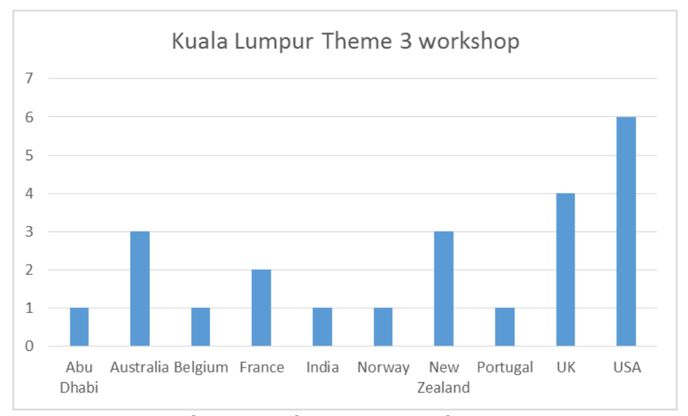
Fig. 1. Bar chart of country of employment of participants at the Theme 3 workshop in Kuala Lumpur.

This workshop was well attended and brought together a range of disciplines to provide broad perspectives on priorities for the evaluation of climate models. Key variables for model evaluation were documented along with sources of observational data. This is a key resource in the planning of the upcoming #GACH workshop and the ultimate output of providing the Antarctic component of ESMValTool – a major global community effort to develop standardised metrics for IPCC-class (CMIP) climate models (https://www.esmvaltool.org/).