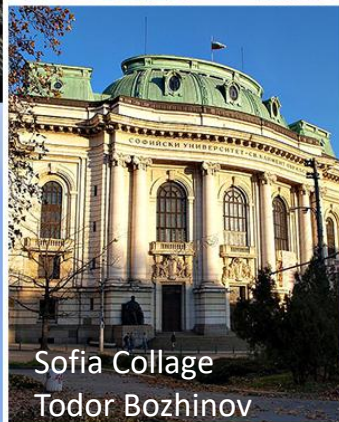
Sofia Collage Todor Bozhinov