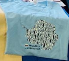
Sofia Science Festival 2020